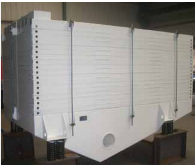
Production machine MHR 20/28/XVII (2 IIX) width 2000 mm, length 2800 mm with 17 decks in two screen units